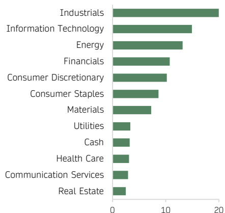
Portfolio weights are subject to change.