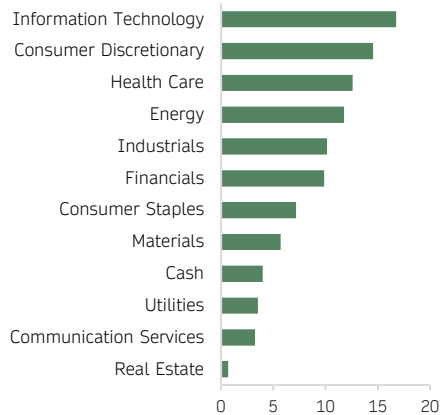
Portfolio weights are subject to change.