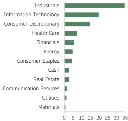
Portfolio weights are subject to change.