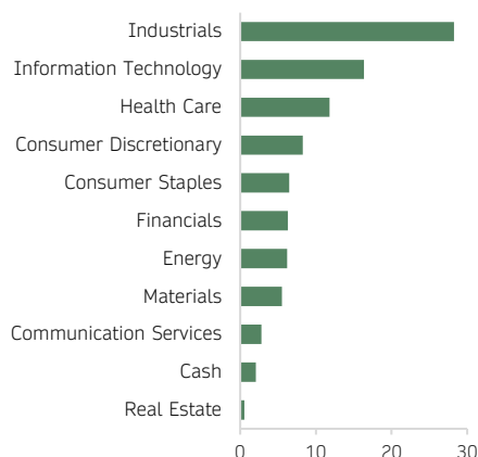
Portfolio weights are subject to change.