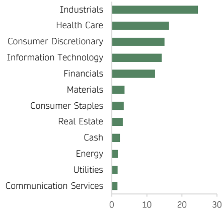
Portfolio weights are subject to change.